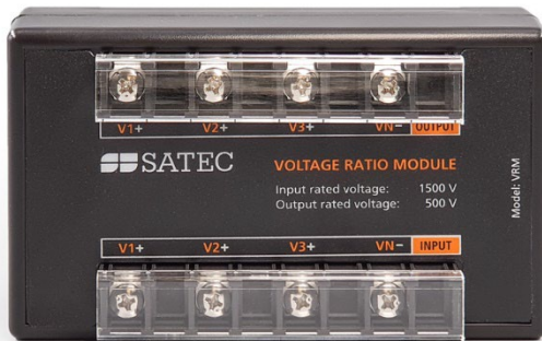
Figure 2: VRM Module